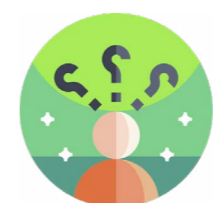
"Who knows Graig?" Team Award

Awarded to the Corporate Team of 4 riders who complete the "Full Monty" route in the fastest time.