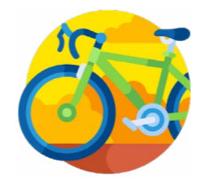
"Billy Whizz" Team Award

If the challenge of the ride itself was not enough, there will be several Corporate Team awards presented at the Gala Dinner together with a magnum of champagne for each. The awards will include the following: