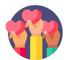
"Tidy sum" Team Award

The Corporate Team of 4 riders that can complete correctly a series of questions drawn from knowledge of the history of Graig Shipping PLC and questions that can only be answered on the ride day.